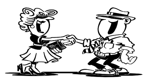
A smart answer.

"A lady was picking at the grocery store, but enough for her family. these turkeys get any replied, "No ma'am,